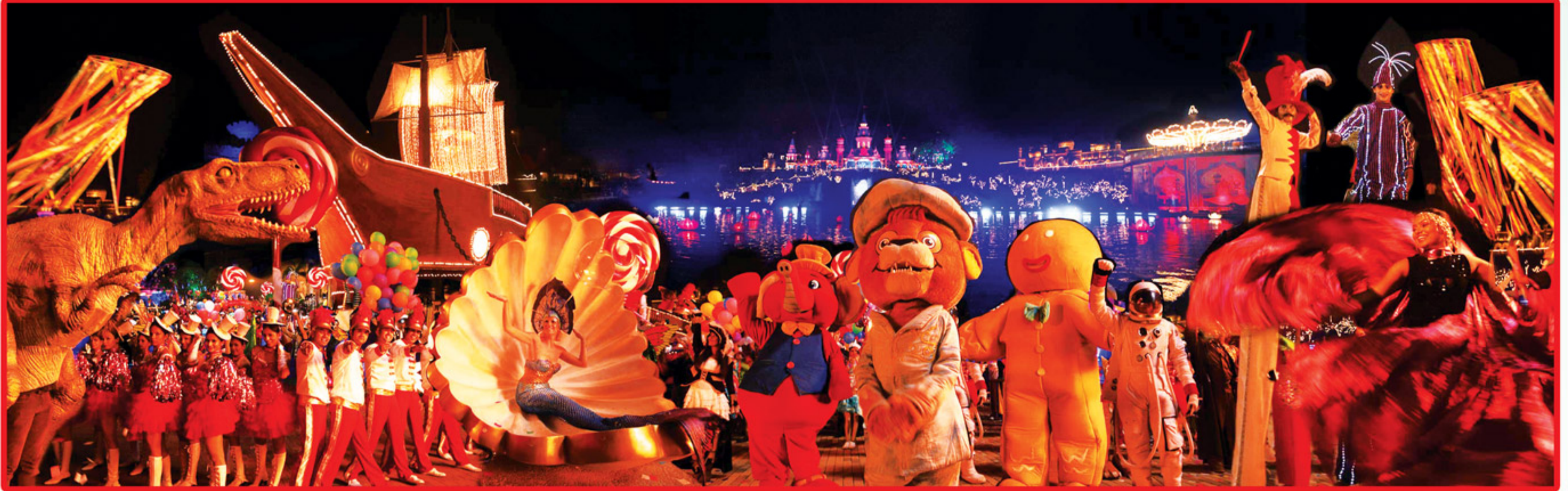
Entertainment Dance & Performance Shows like B-Boying Battle, Hip Hop Dancers, Acrobat Performers, BMX Cycle Stunts & Theme Show (Tubby, Snow-white, Pirates, Cinderella, and Three Piglets etc.)