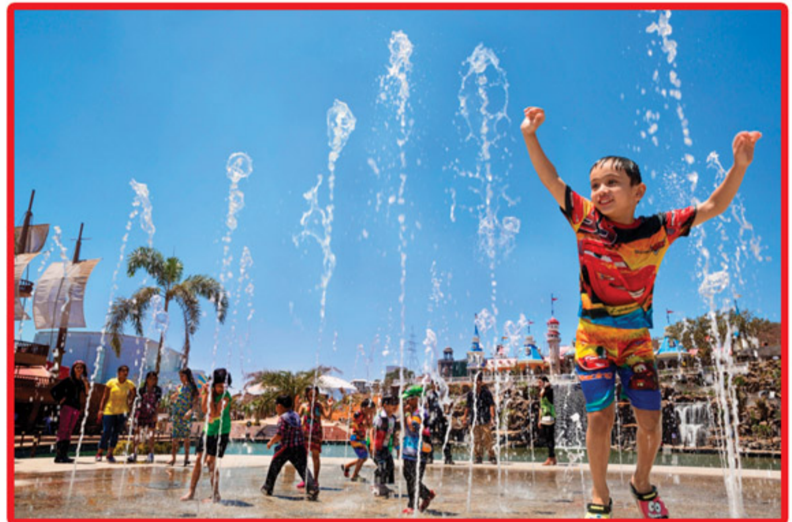
POP JET LAWN