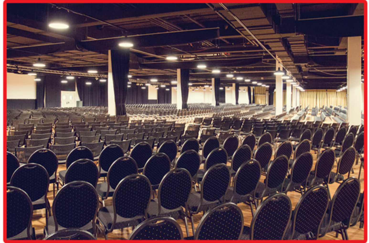
IMAGICA CAPITAL HALL 2