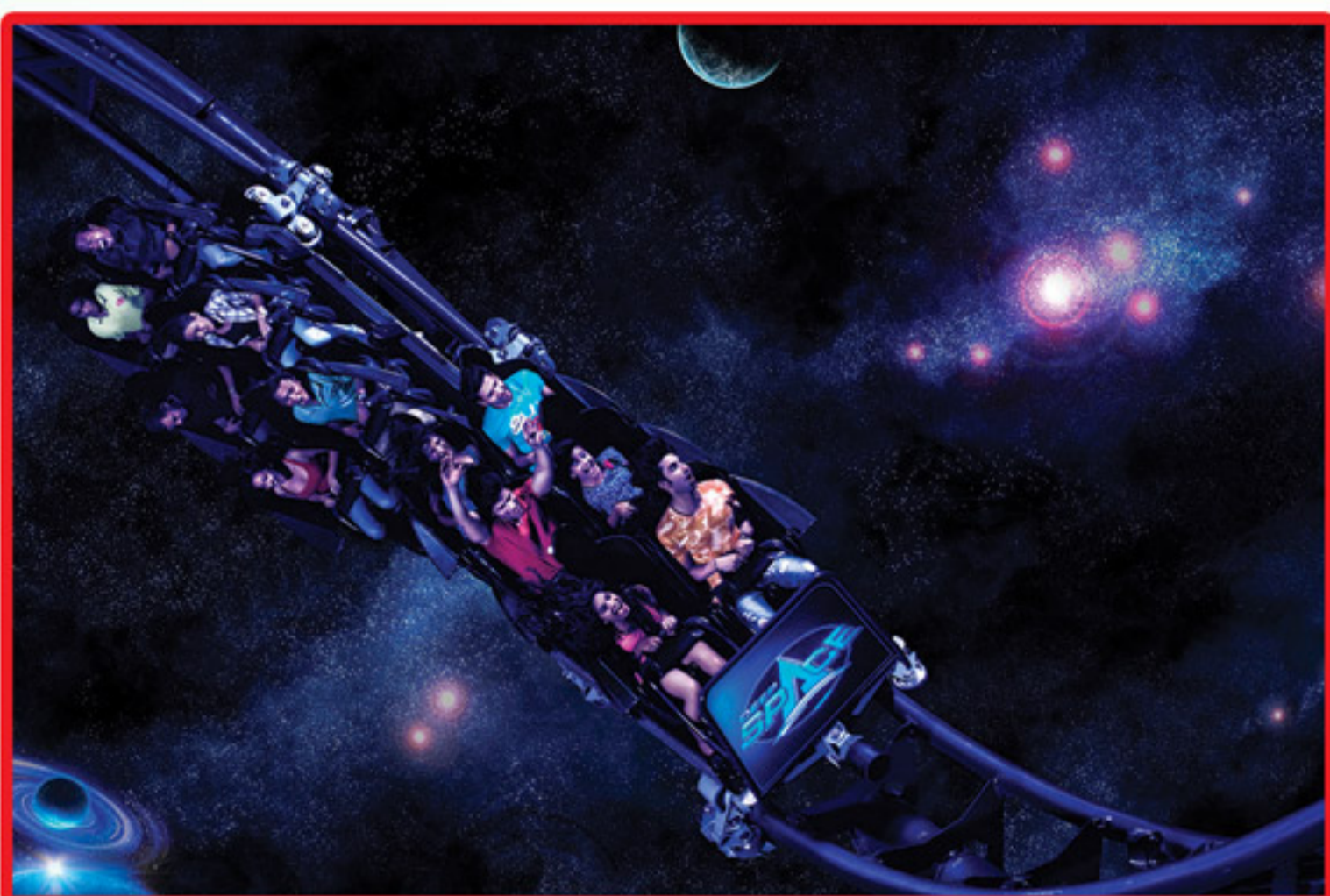
DEEP SPACE VALLEY