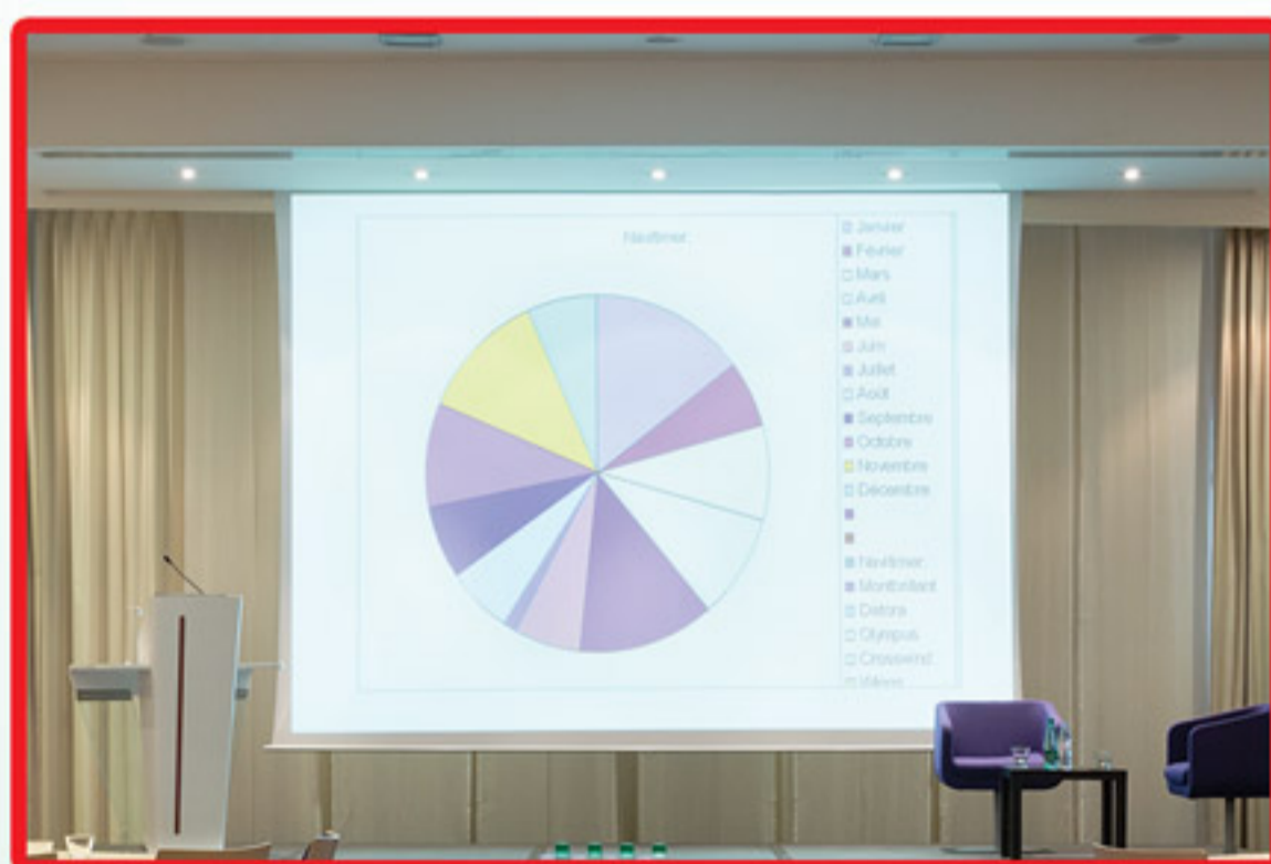
Projector & Screen