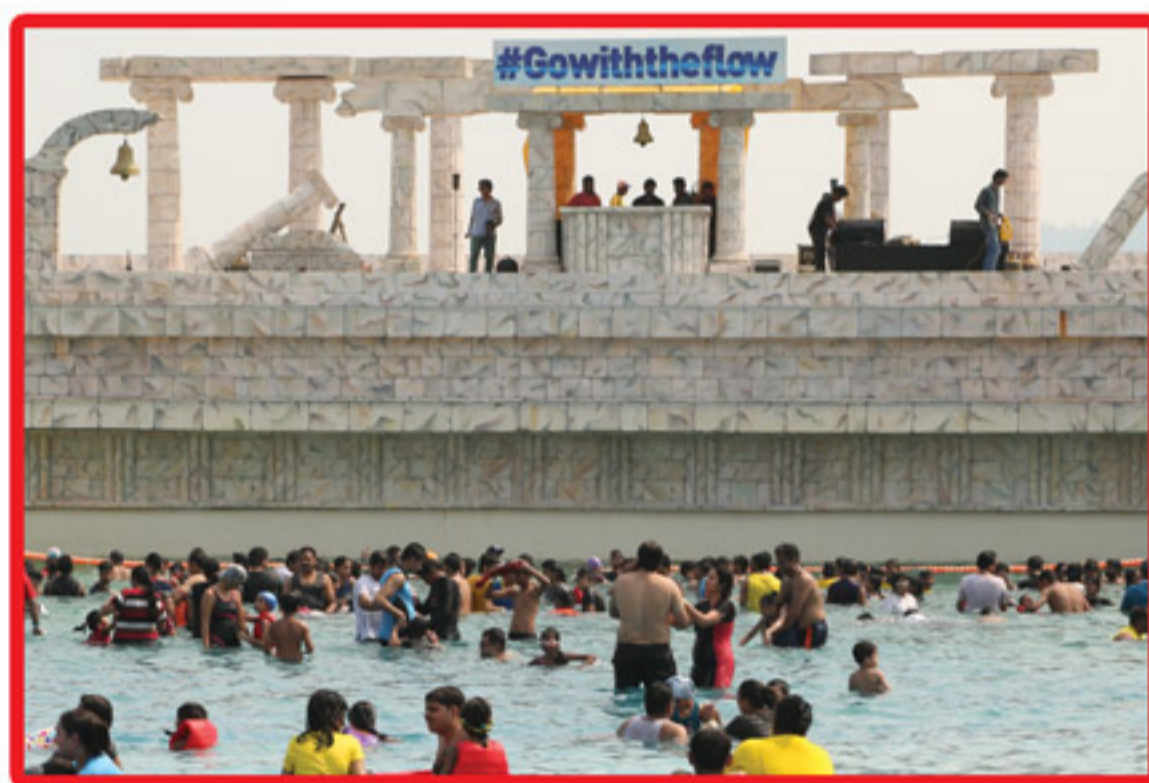
DJ & Music System