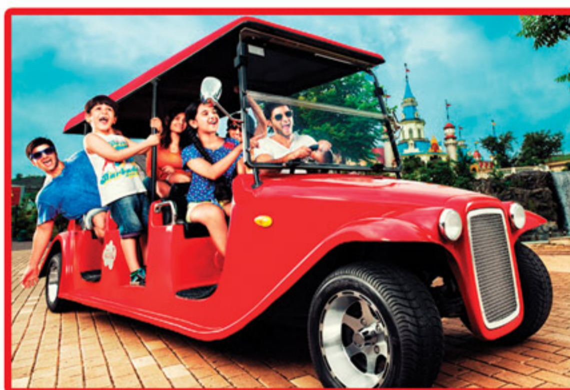
Pick up and Drop