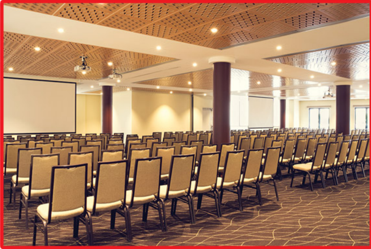
IMAGICA CAPITAL HALL 1