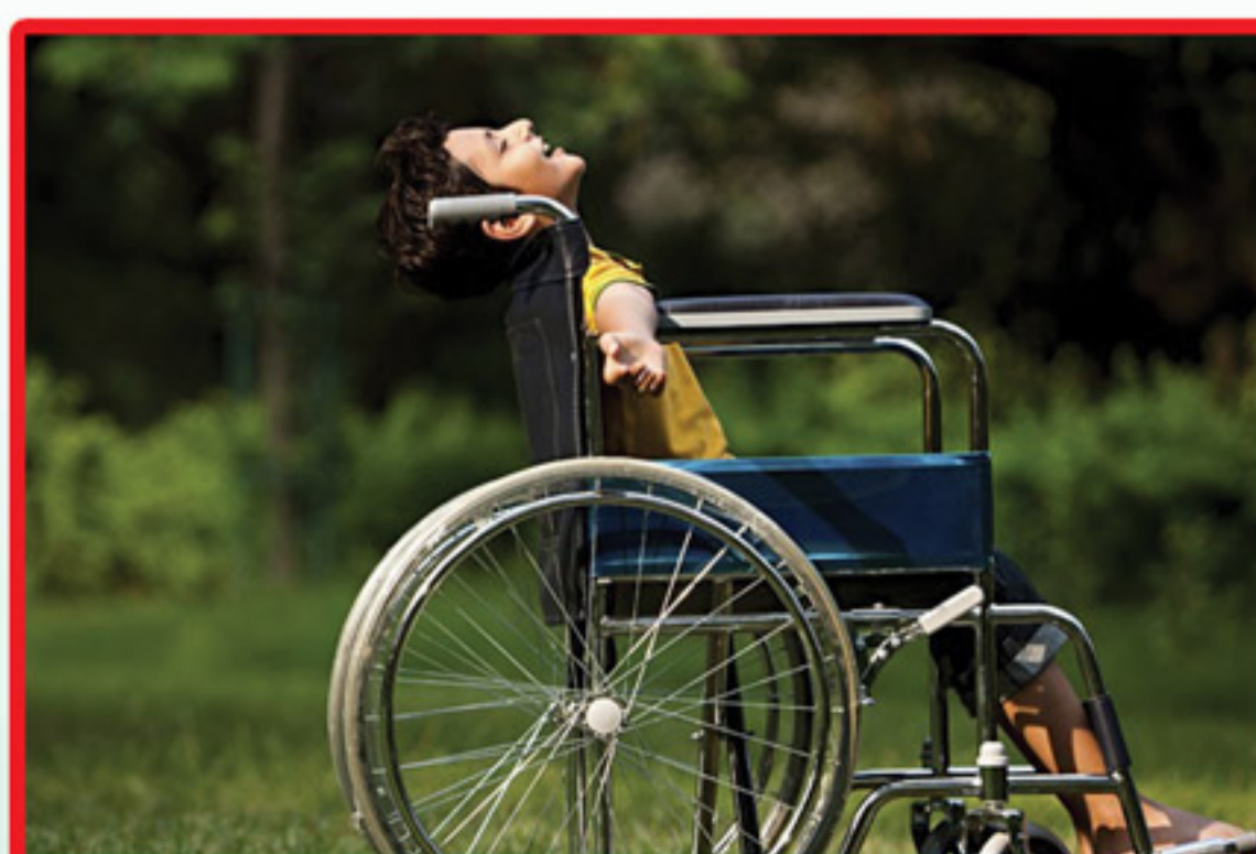
Wheel Chair Access